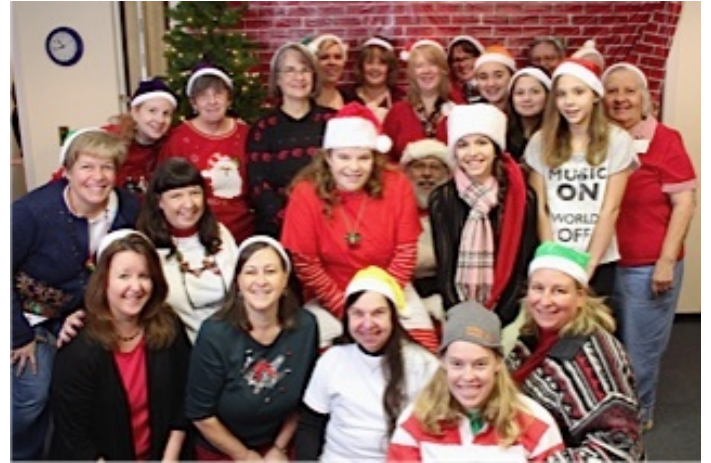
Breakfast with Santa