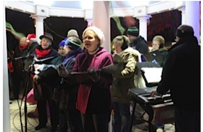
Stepney Tree Lighting