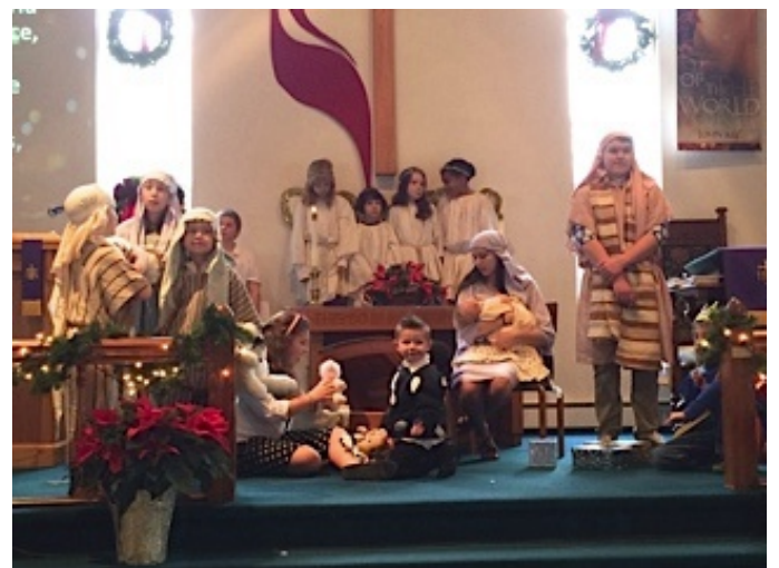
Children's Christmas Pageant