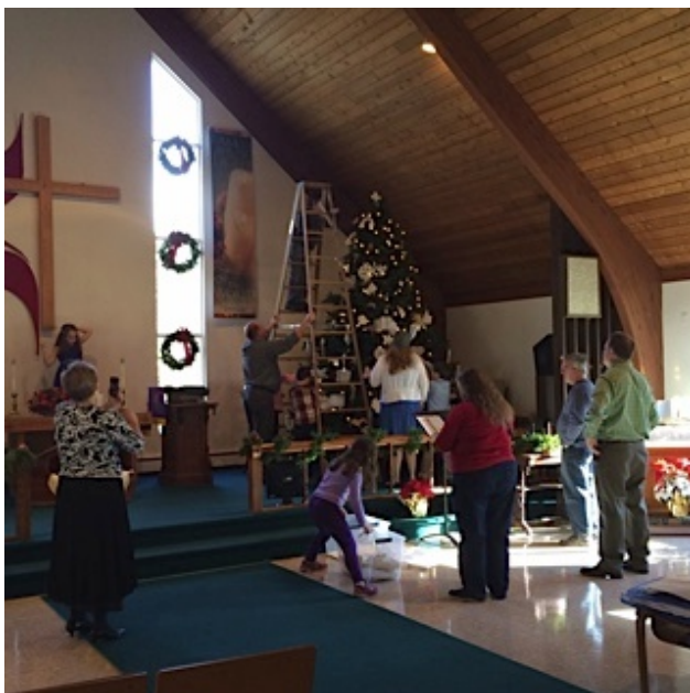
Decorating the Christmas Tree