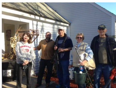
Church Work Day Saturday, November 19