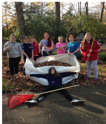
Youth Clean Up: Sunday, October 30