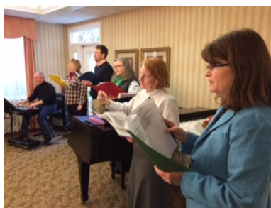
Sing-A-Long at Atria Sunday, November 20