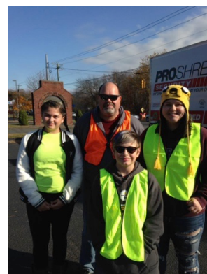
Paper Shredding Fundraiser: Saturday, November 5