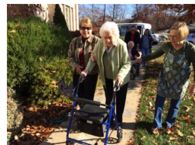
Wicke Luncheon: Wednesday, November 16