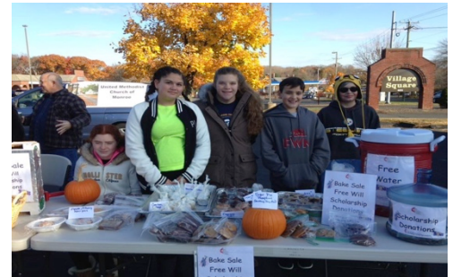
Paper Shredding Fundraiser: Saturday, November 5

Friends are always welcome to our youth events – no need for them to belong to our church!!