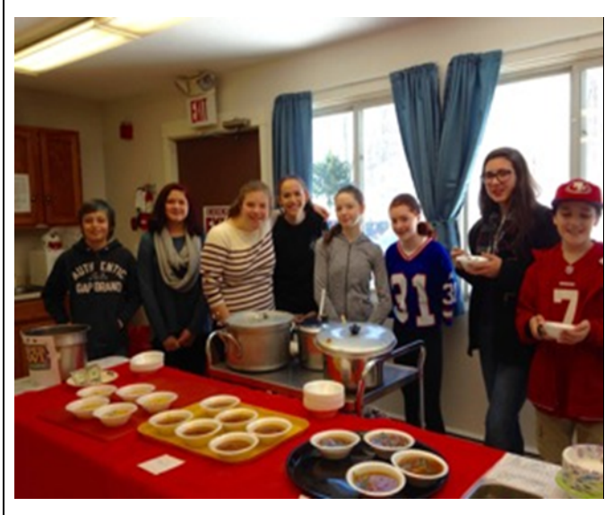
Thanks to everyone who helped with this year's SouperBowl Celebration of Boy Scout Sunday on February 14th of Caring. We raised over $500 which will be donated to the Monroe Pantry and King's Pantry in Bridgeport.

We are not meeting on March 27<sup>th</sup>, Easter