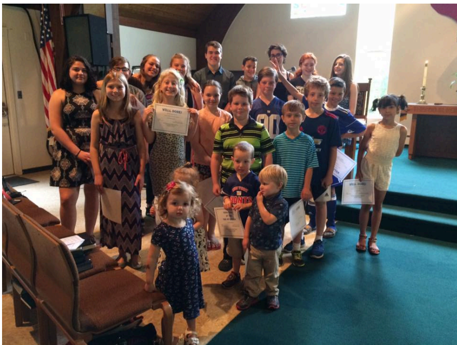
All of our youth celebrating the end of another year of Sunday School. Enjoy your summer and we'll see you on September 10!