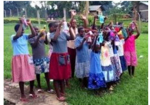
Dresses made in Monroe were delivered to the girls at the Orphanage in Uganda. Do you see any dresses you made?

UMC Monroe Contacts: Ethel Abraham and Tanya Lennon