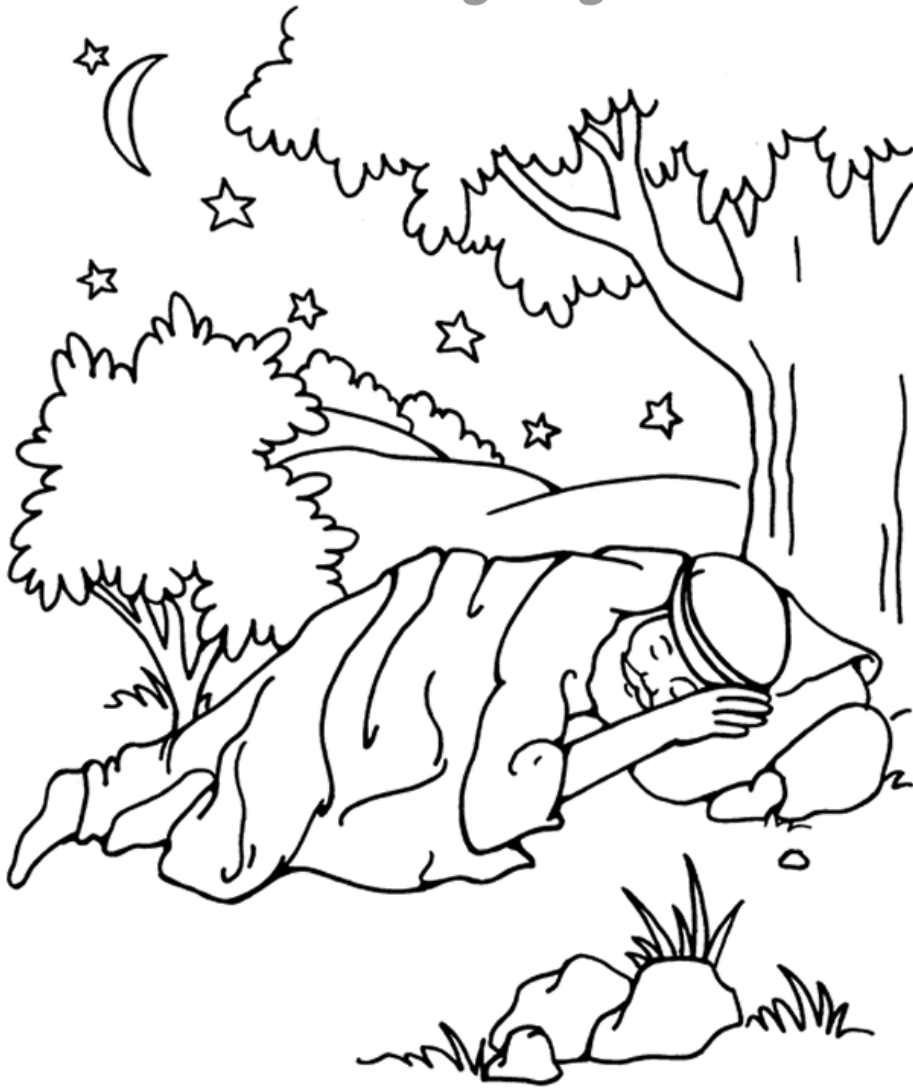
God Cares for Jacob