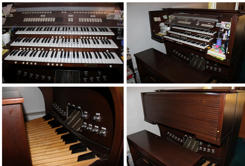
United Methodist Church of Monroe Rogers Organ Company Providence 330 1973

Submitted by: Frank Denton, October 2013