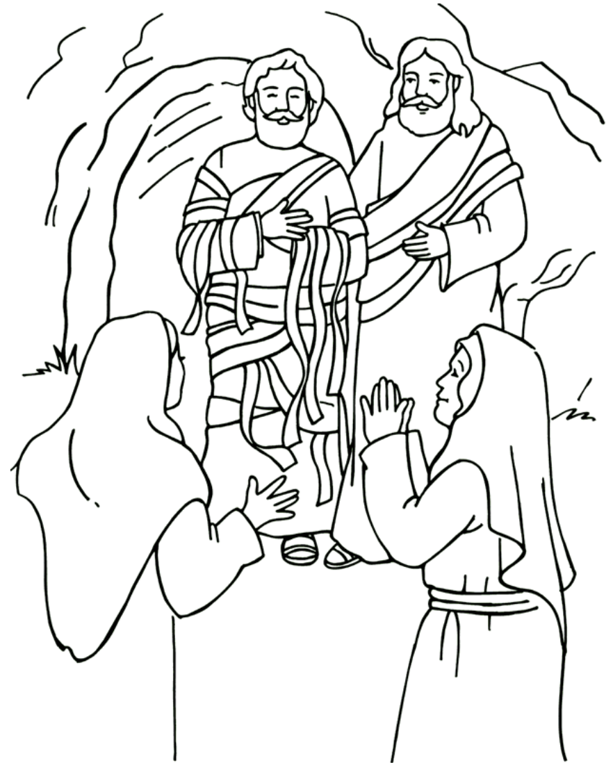
Jesus Raises Lazarus