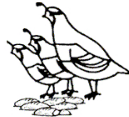
Manna & Quail