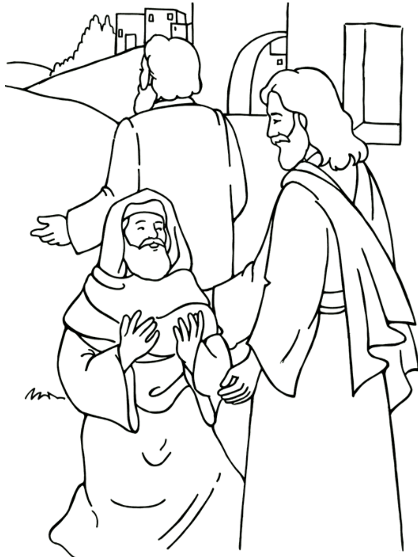
The Ten Lepers Luke 17:11-19

Each number represents a letter of the alphabet. Substitute the correct letter for the numbers to reveal the coded words.