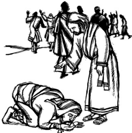
Jesus Heals 10 Lepers

Copyright © Sermons4Kids, Inc. May be reproduced for Ministry Use