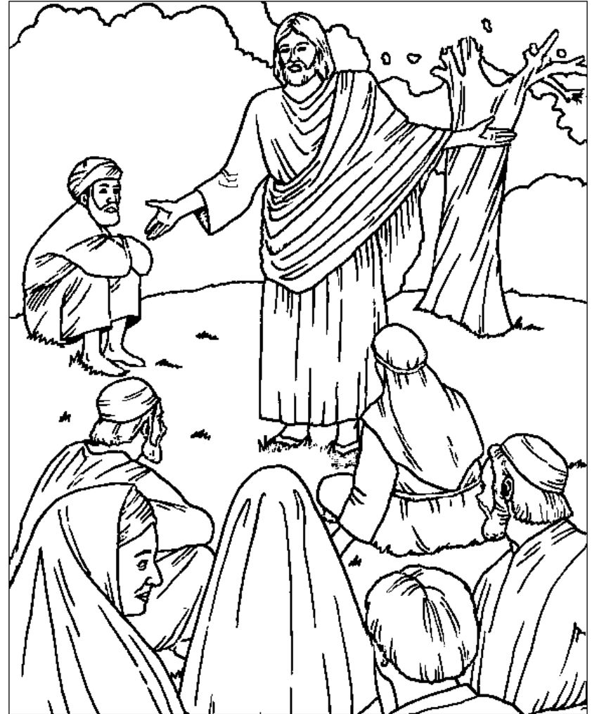
The Sermon on the Mount Matthew 5:1-12

From BibleStoryCard Learning System(tm) Coloring Book © 1996 Wesleyan Publishing House. Used by permission. Additional BibleStoryCard resources are available by calling 1-800-493-7539 or visiting online http://www.wesleyan.org/941/biblestorycards