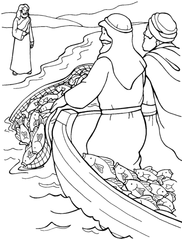
Jesus calls four of his disciples.

From Thru-the-Bible Coloring Pages for Ages 4-8. © 1986, 1988 Standard Publishing. Used by permission. Reproducible Coloring Books may be purchased from Standard Publishing, www.standardpub.com , 1-800-543-1301.