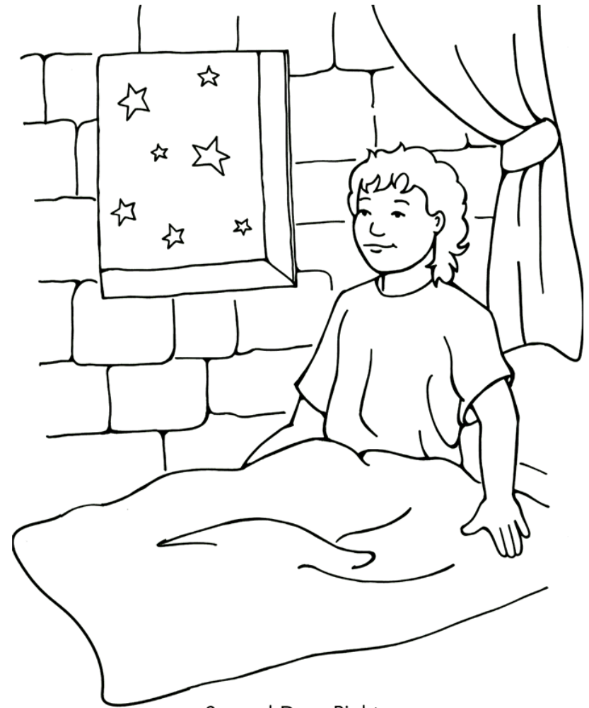
Samuel Does Right 1 Samuel 2-4, 7

From Thru-the-Bible Coloring Pages for Ages 4-8. © 1986, 1988 Standard Publishing. Used by permission. Reproducible Coloring Books may be purchased from Standard Publishing, www.standardpub.com , 1-800-543-1301.