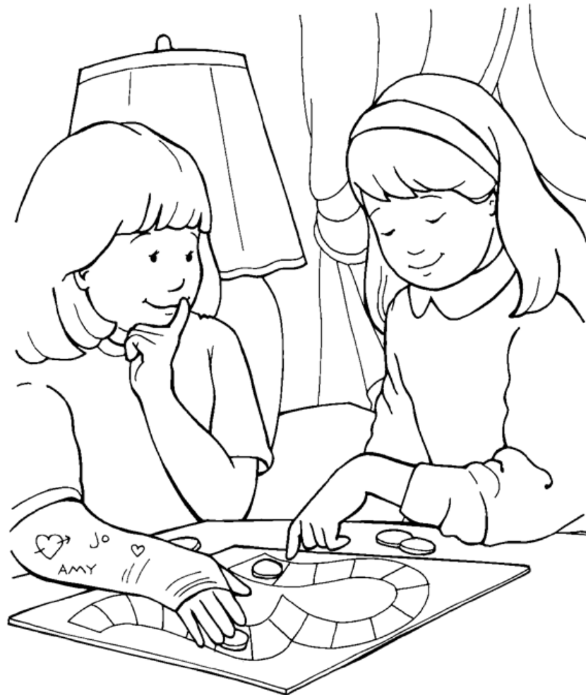
Showing Kindness Toward Others

From Thru-the-Bible Coloring Pages for Ages 4-8. Standard Publishing. Used by permission. Reproducible Coloring Books may be purchased from Standard Publishing, www.standardpub.com , 1-800-543-1301.