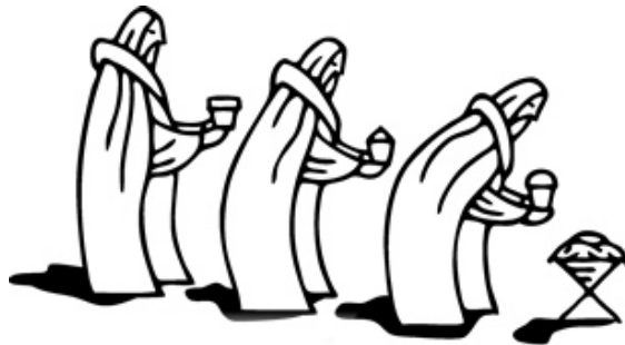
The Magi bring gifts