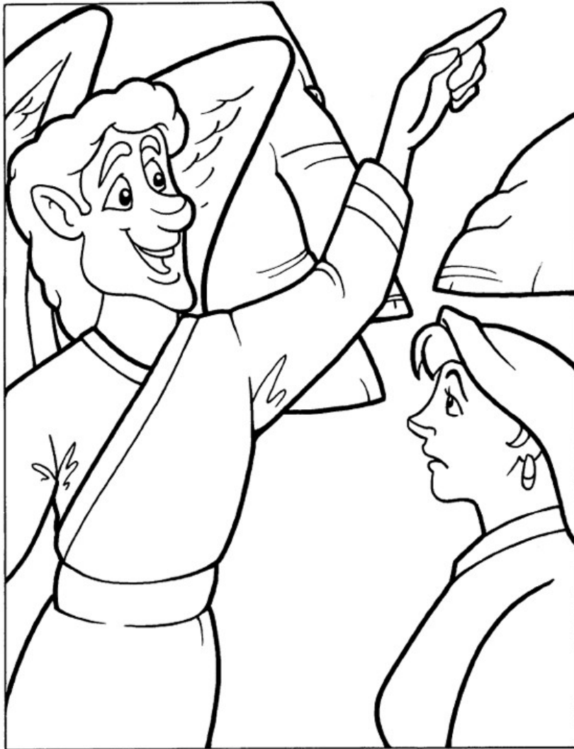
"He is not there, he is risen" Mark 16:6