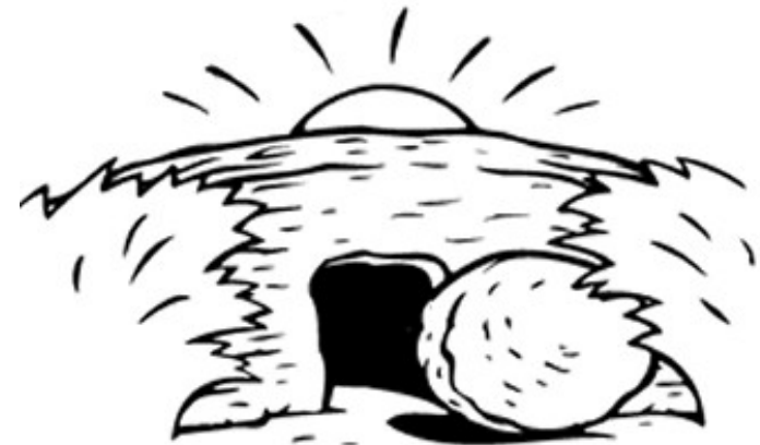
"He has risen! He is not here." Mark 16:6