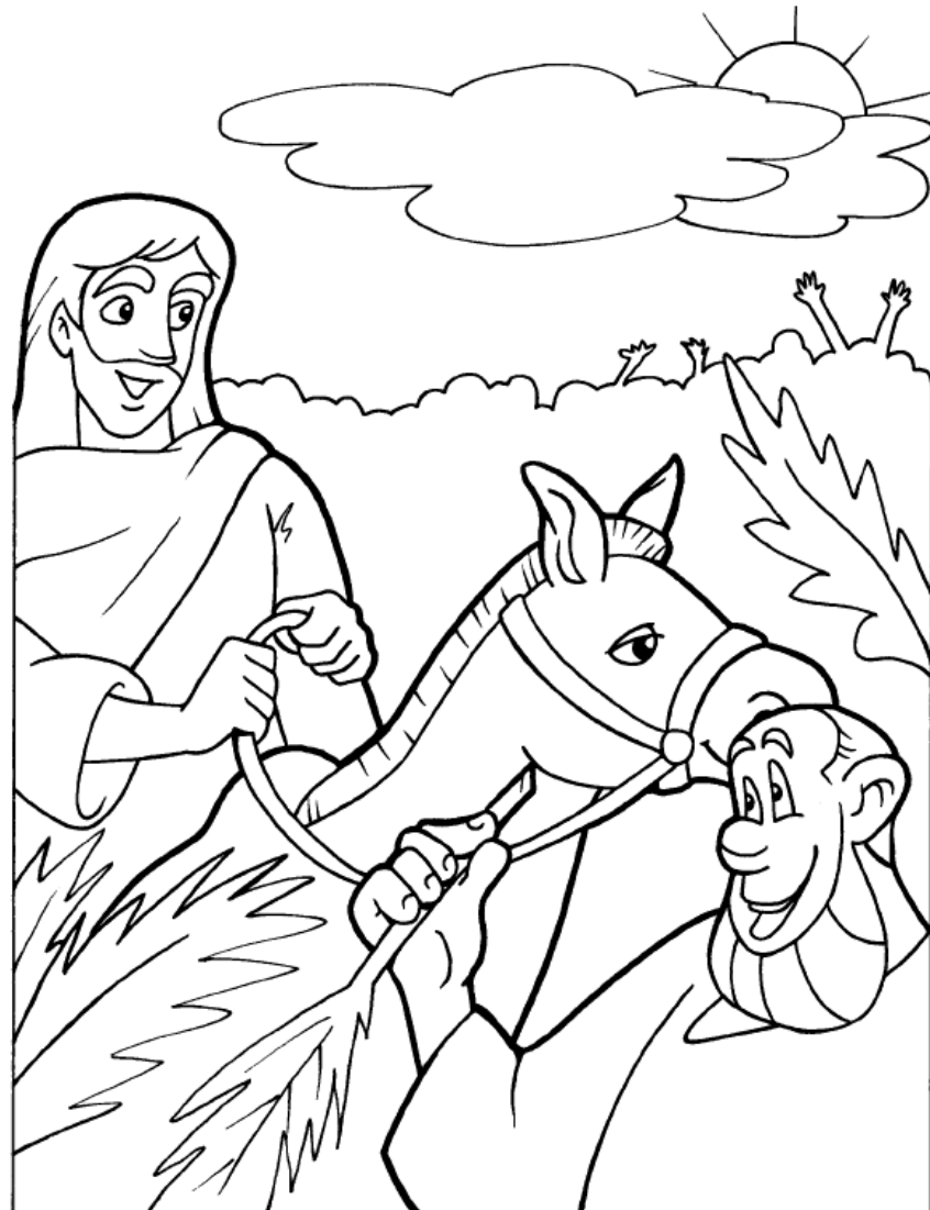
The Triumphal Entry