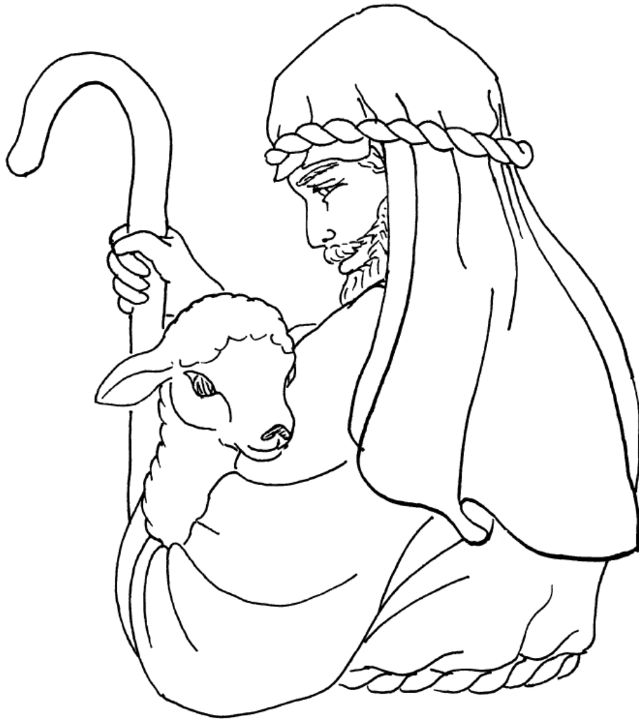
The Good Shepherd