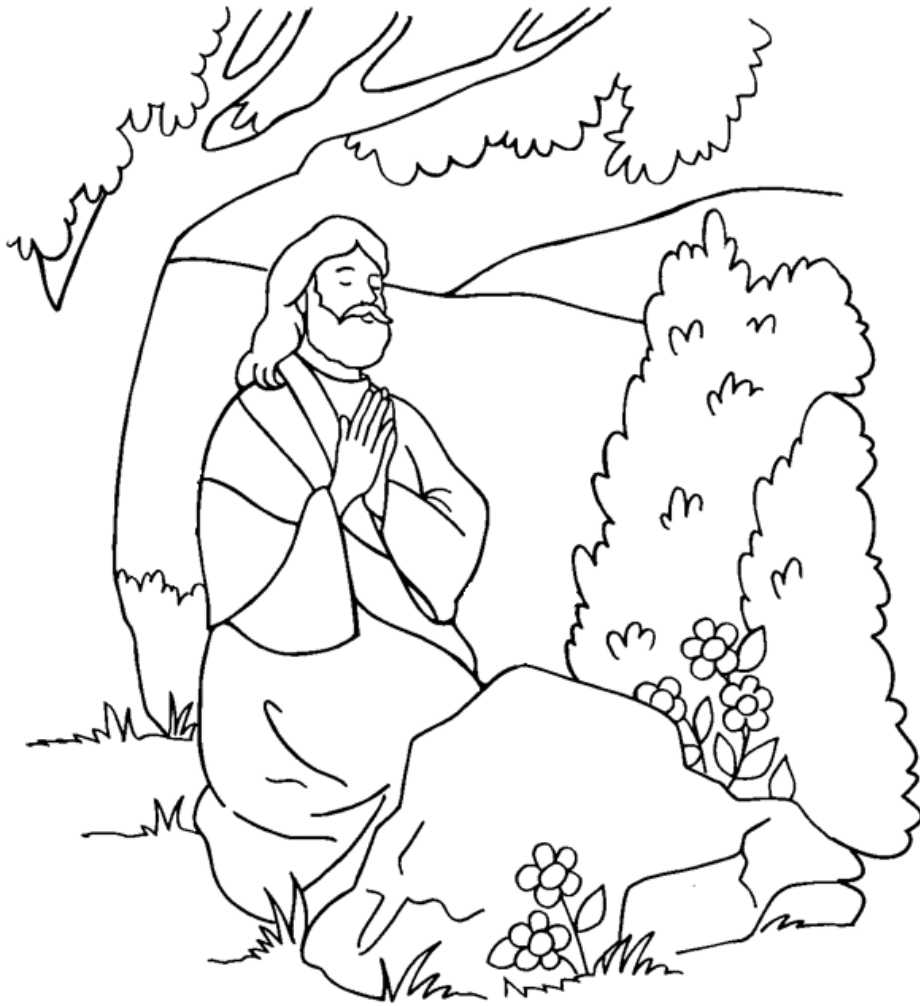
Jesus Prays for His Disciples