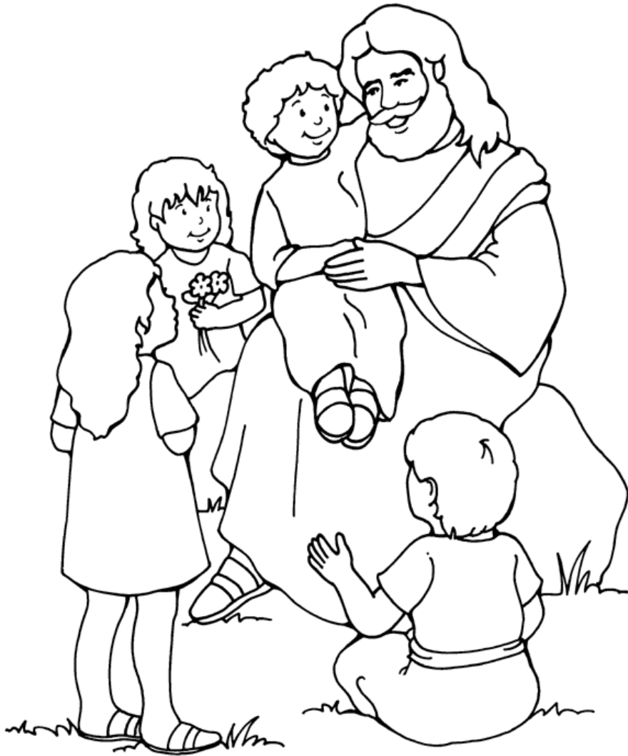
Jesus and the Children

From Thru-the-Bible Coloring Pages © 1986, 1988 Standard Publishing. Used by permission. Reproducible Coloring Books may be purchased From Standard Publishing, www.standardpub.com, 1-800-543-1301.