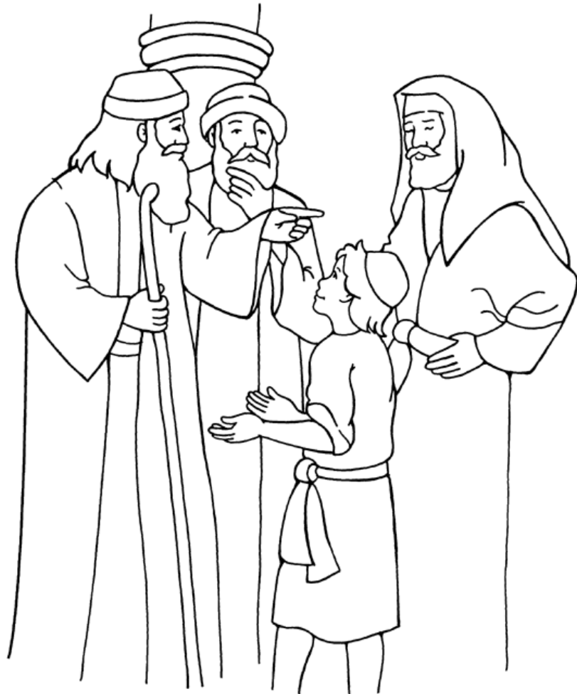
Jesus in the Temple Luke 2

Can you help Mary and Joseph find Jesus in the Temple?