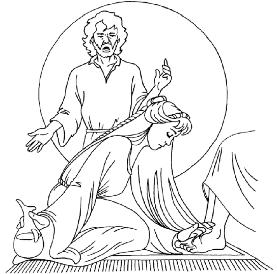
Mary Anoints Jesus' Feet John 12:1-8

Copyright © CalvaryCurriculum.com Used by Permission