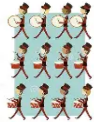
TWELVE DRUMMERS DRUMMING